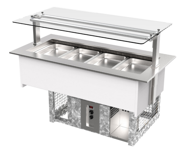
Showing: Inline GN Series refrigerated in-counter 4x 1/1 pans, fitted with flat self-serve gantry (option) and GN pans (accessories)

Constructed from toughened safety glass and fitted with 50,000 hour LED lighting at 1500 lumens per metre