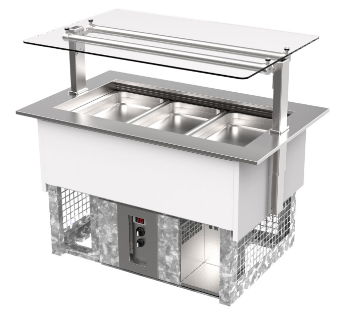
Showing: Inline GN Series refrigerated in-counter 3x 1/1 pans, fitted with flat self-serve gantry (option) and GN pans (accessories)

Constructed from toughened safety glass and fitted with 50,000 hour LED lighting at 1500 lumens per metre