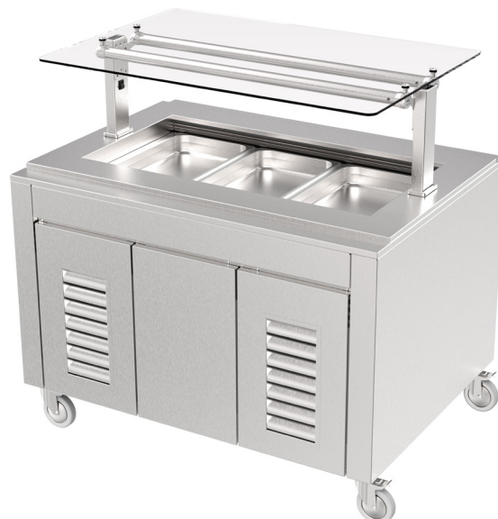
Showing : Inline GN Series Mobile refrigerated 3x 1/1 pans, fitted with flat self-serve gantry (option) and GN pans (accessories)