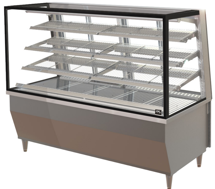
Showing : Inline 5000 Series heated 1800mm square freestanding fixed front