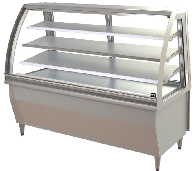
Showing : Inline 5000 Series controlled ambient 1800mm curved freestanding tilt front with integral refrigeration