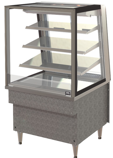
Showing : Inline 5000 Series refrigerated 800mm square freestanding open front with integral refrigeration