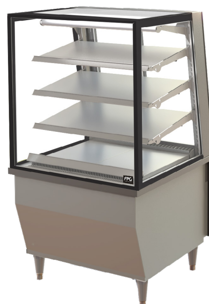
Showing : Inline 5000 Series refrigerated 800mm square freestanding fixed front with integral refrigeration