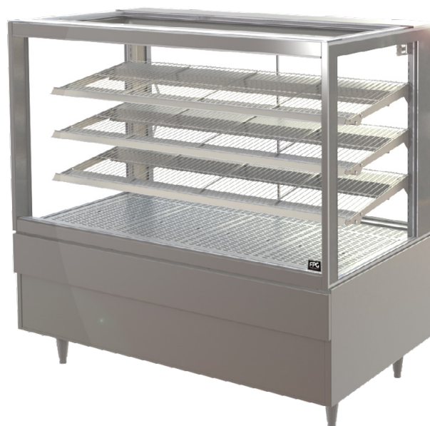
Showing : Inline 4000 Series heated 1500mm square freestanding with fixed front