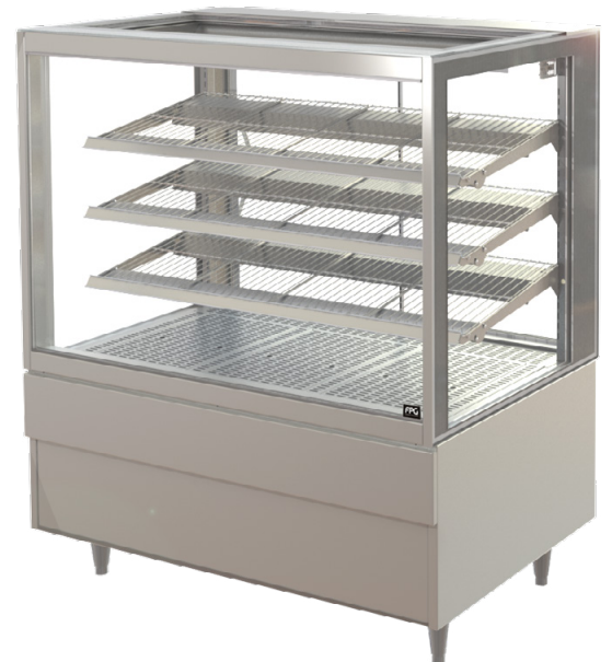
Showing : Inline 4000 Series heated 1200mm square freestanding with fixed front