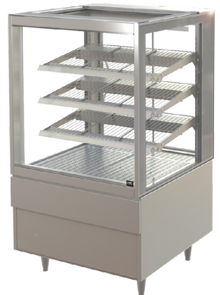
Showing : Inline 4000 Series heated 800mm square freestanding with fixed front