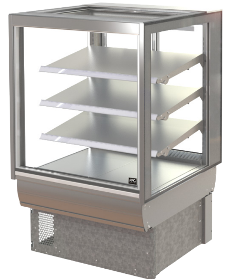
Showing : Inline 4000 Series controlled ambient 800mm square in-counter fixed front with integral refrigeration