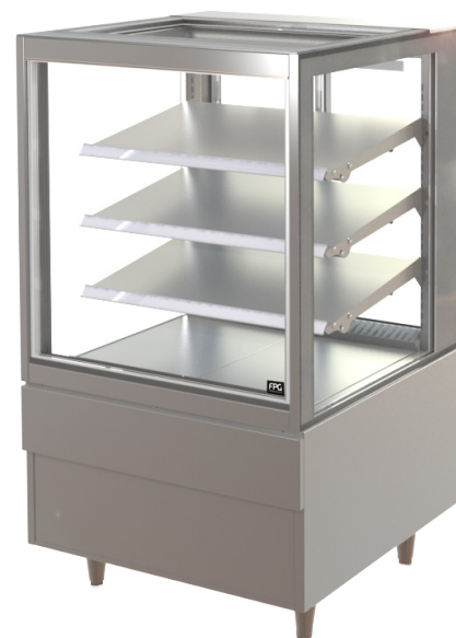
Showing : Inline 4000 Series controlled ambient 800mm square freestanding fixed front with integral refrigeration