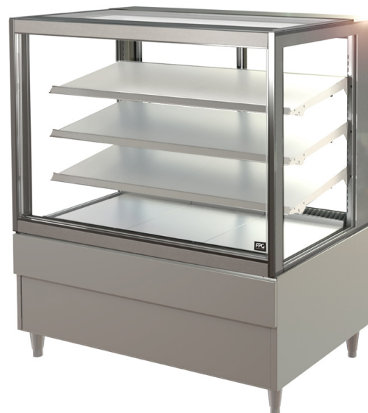
Showing : Inline 4000 Series refrigerated 1200mm square freestanding fixed front with integral condensing unit