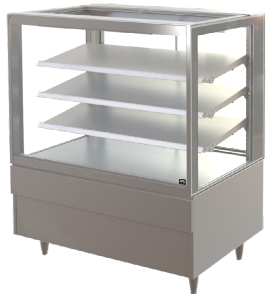
Showing : InLine 4000 Series ambient 1200mm square freestanding fixed front