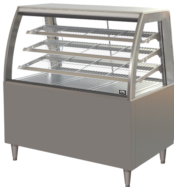
Showing : Inline 3000 Series heated 1200mm curved freestanding fixed front