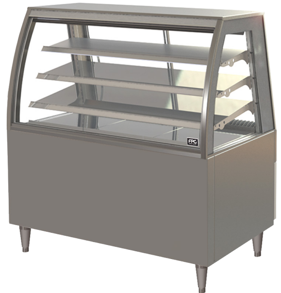
Showing : Inline 3000 Series controlled ambient 1200mm curved freestanding fixed front with integral refrigeration