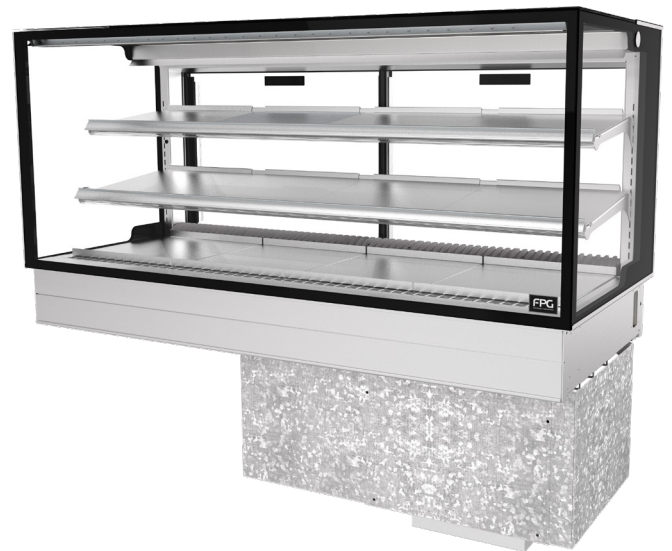
Showing : Inline 3000 Series refrigerated 1500mm square in-counter fixed front with integral refrigeration