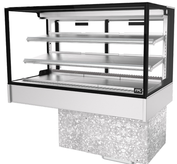
Showing : Inline 3000 Series refrigerated 1200mm square on-counter fixed front with integral refrigeration