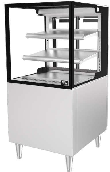
Showing : Inline 3000 Series refrigerated 600mm square freestanding fixed front with integral refrigeration