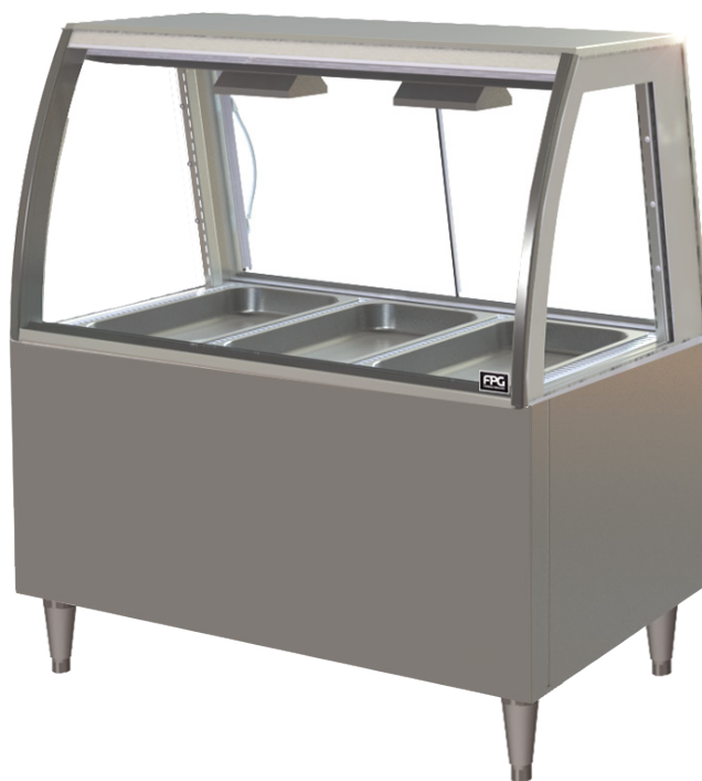
Showing : Inline 3000 Series Bain Marie heated 1200mm curved freestanding fixed front